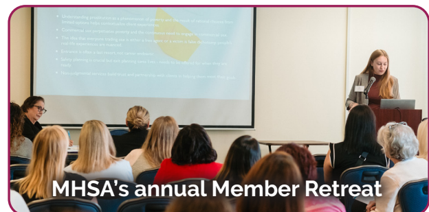
MHSA's annual Member Retreat